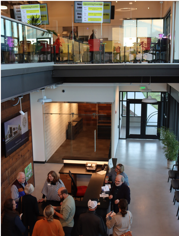
Supporters enjoying our new lobby and second floor Honeyberry Culinary Classroom at our November 30 Donor Appreciation event.